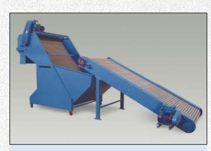
CONVEYOR & HOPPER FEEDER